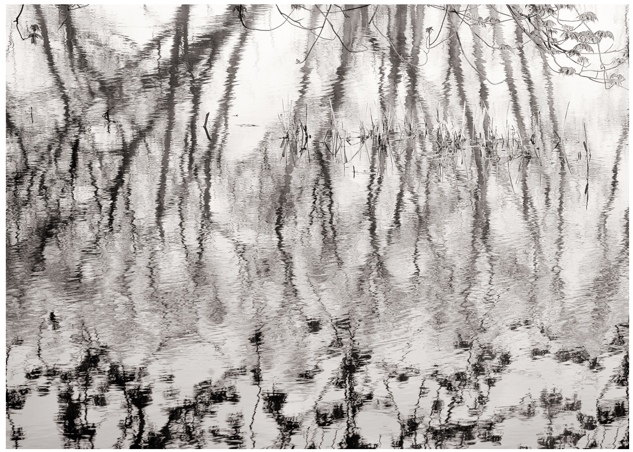
Reflections on the Des Plaines River, Near Wadsworth, Illinois