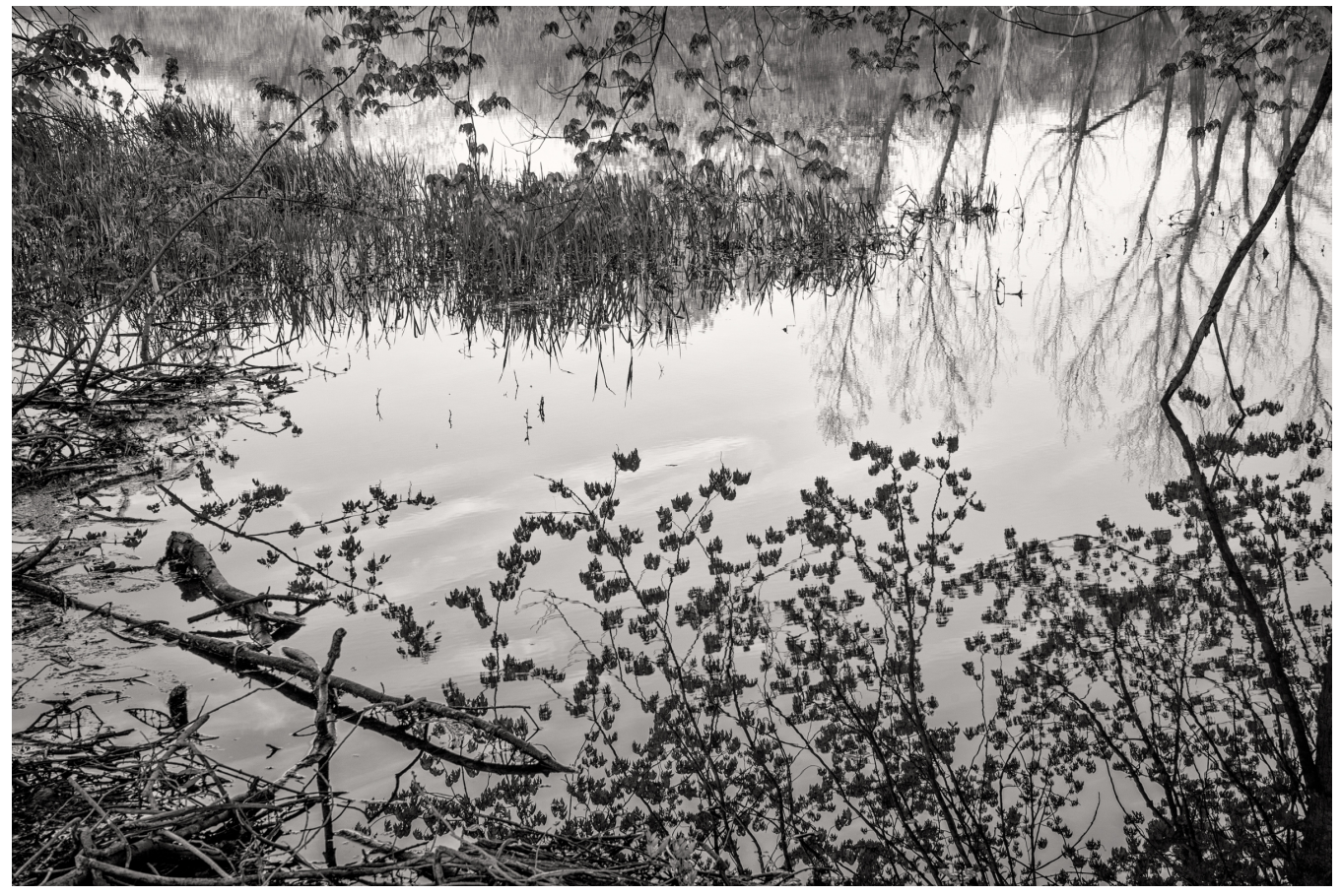
Des Plaines River, Wadsworth, Illinois

Creating photographs in these open, preserved, sometimes restored landscapes provides a quietude that does not exist elsewhere—an escape from the everyday world, and a chance to glimpse a world that came before us and will undoubtedly endure long after we are gone.