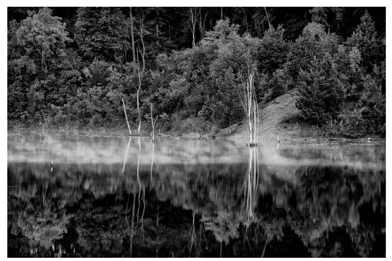
Independence Grove Forest Preserve, Lake County, Illinois